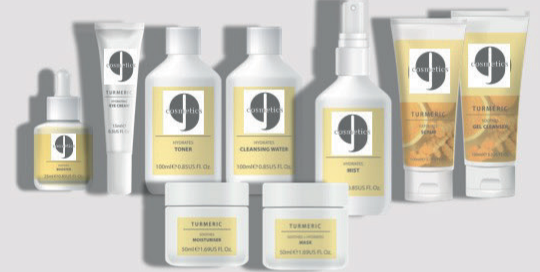
READY-TO-GO FORMULATION LIBRARY